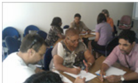
Small group case discussion of patients with pain