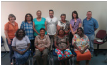
Aboriginal Health Practitioners complete the 1 day EPM program December 2013

Indigenous Australians living in remote regions of our vast country suffer pain to at least the same extent as the coastal fringe, urban dwelling population, however they have extreme difficulties accessing mainstream services. Frontline health care is provided by aboriginal health practitioners living in these communities where up to date pain management education has been difficult to provide.